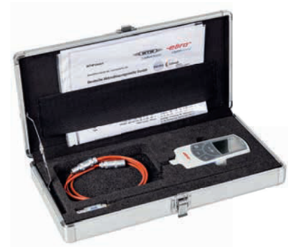
TFX 430 set

Various probes available (please see page 99).