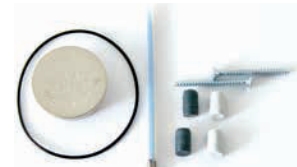
AG 170 Battery exchange set