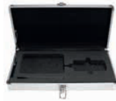
AG 130 Small case