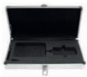
AG 130 Transport case