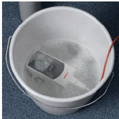
TF 410 - still working, thanks to IP 67