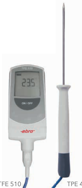
TFE 510 TPE 400