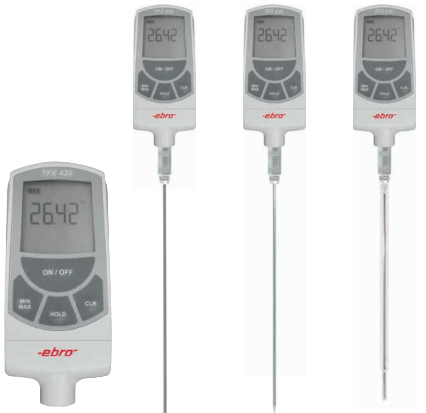
TFX 430 without probe TFX 430 + TPX 130 TFX 430 + TPX 230 TFX 430 + TPX 330