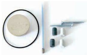
AG 170 Battery exchange set