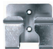
AG 160 Stainless steel bracket