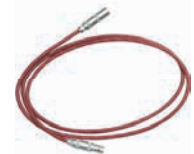
AX 110 Extension cable for TFX 430 only