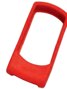
AG 140 Protective cover for handheld devices, red