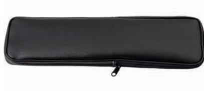
AG 120 Artificial leather case