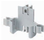
AG 150 Plastic bracket suitable for 10 mm and 12 mm lamus tripods