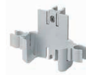
AG 150 Plastic bracket, suitable for 10 mm and 12 mm lamus tripods