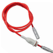
AX 100 Extension cable for TFX devices, 1m, Lemosa size 0