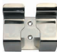
AG 161 Stainless steel bracket for thermometers with protective cover AG 140