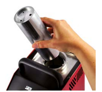
Dry block calibration